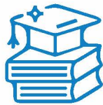
EDUCATION IN CANADA