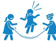
ACTIVITIES FOR YOUTH