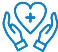
HEALTH & WELLBEING