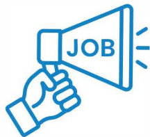
EMPLOYMENT AND SKILLS SUPPORT