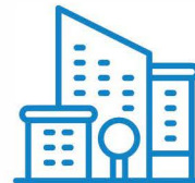
GETTING INVOLVED IN THE CITY